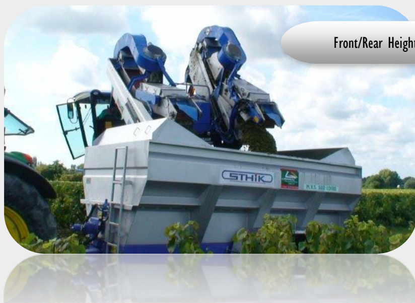
Front/Rear Height Extensions